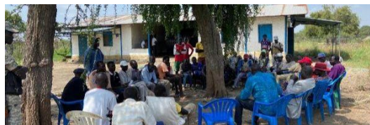
Left: Briefing with the armed youth, chiefs and women in Lekuangole, 4 December

The POF team is working to facilitate a meeting between the Lou Nuer and the Murle in Pieri that would establish a peace ‘gesture’. This will be followed up direct engagement with the armed youth, who want a locally agreed settlement without the involvement of Juba politicians. Distrust between the Murle and Dinka Bor runs deep. The team is working to establish communication channels to allow both sides to share views and their commitments to a peaceful settlement.